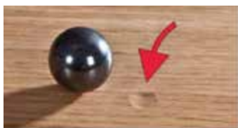
Oak layered board (36.5 N/mm 2 )

The flooring from Venifloor is 41% harder than a layered oak board.