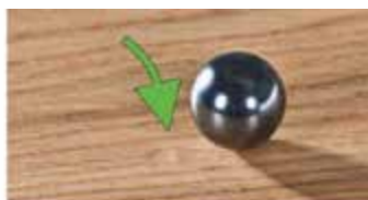
Venifloor oak board (51.5 N/mm 2 )