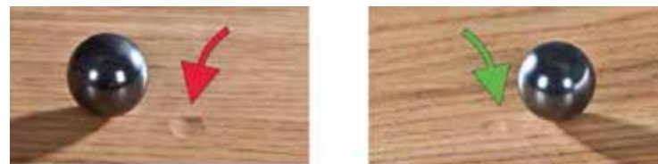
Oak layered board (36.5 N/mm 2 )

The flooring from Venifloor is 41% harder than a layered oak board.